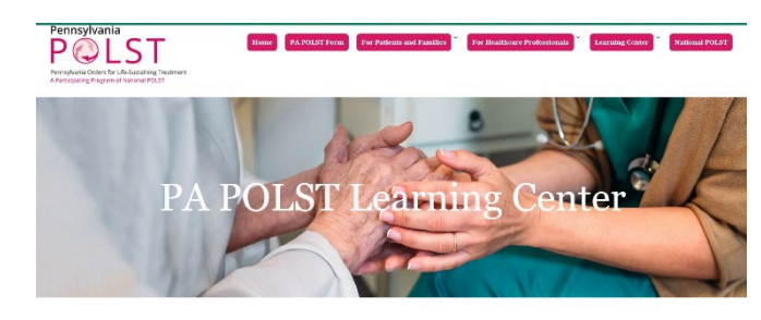
Pictured is the new POLST Learning Center website for continuing education program.

The new <u>POLST Learning Center</u> features ondemand learning modules that provide a more convenient, accessible method for professionals to gain valuable skills in having end-of-life