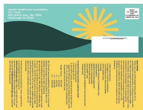
The informational mailer sent across western Pennsylvania to raise awareness about the support available for people living with HIV.

In concert with the direct mailers, a digital marketing campaign was deployed to drive traffic to AIDS Free Pittsburgh's new website. Since January, the AIDS Free Pittsburgh has seen almost 400,000 visitors, with the majority of those visitors tracking to the Living with HIV page.