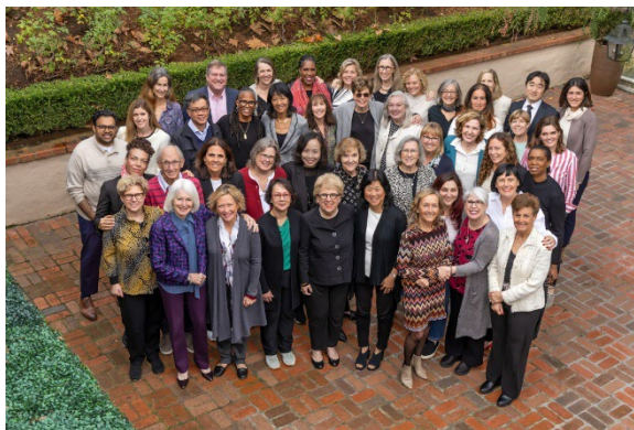
Forty-five leaders from 10 countries convened at the Salzburg Seminar to create an action plan to address the inequities women face as they age.

Forty-five participants from across the globe with expertise in health care, public health, social welfare, public and private insurance, employers and workforce, federal and local government, academia, research, communications, technology innovation, advocacy, international development and global health participated in the fully immersive program to connect, take inspiration from various global perspectives, and develop relationships to coalition build, while engaging in candid, safe, and open exchanges with peers working on the issue of women's health as they age.